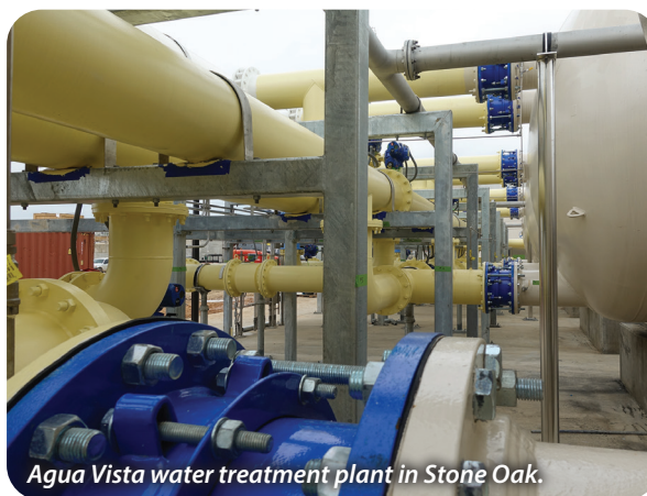
Agua Vista water treatment plant in Stone Oak.

In 1995, 100 percent of San Antonio's water came from the Edwards Aquifer. Fast forward to today, SAWS manages 15 water supply projects originating from nine different sources.