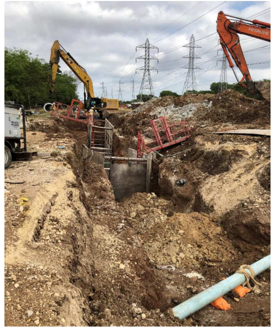
Pipe installed at Sta. 47+00