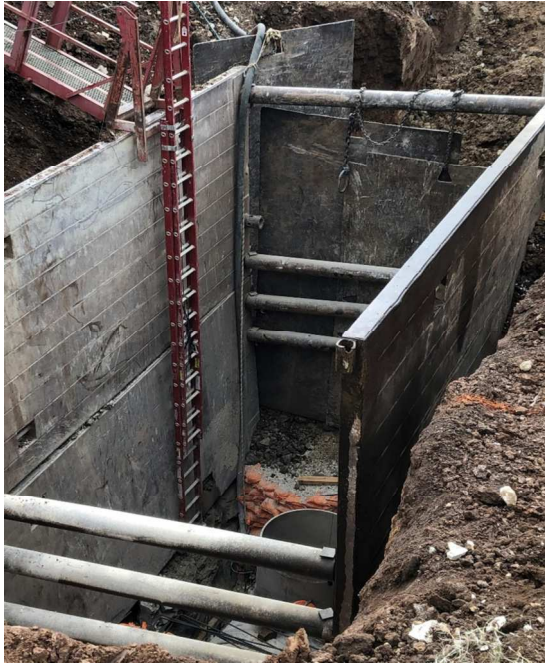
Tee base of MH 46+67.69